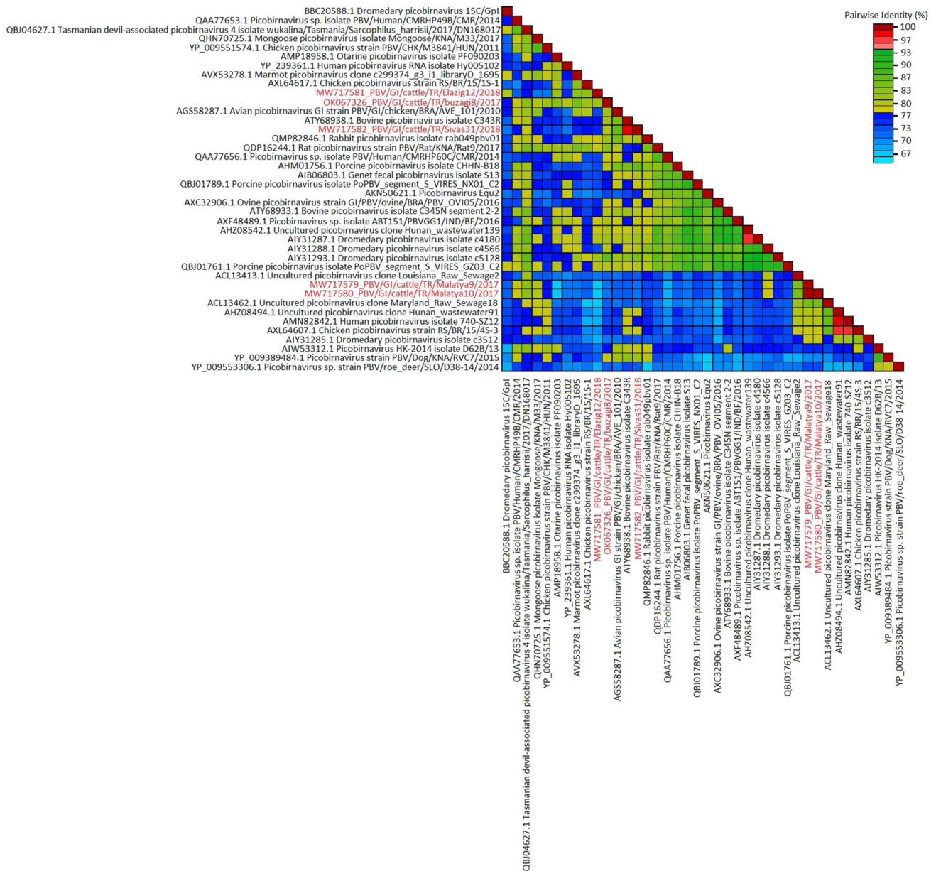
Fig. 1 Sequence demarcation analysis based on 66 residues of the partial putative RdRP protein sequences using SDT v.1.2. tool (Muhire et al., 2014). Sequencing data were aligned by MUSCLE and the pairwise identity percentage was exhibited using a full-colour scale

rotavirus-associated diarrhoea in calves has been reported worldwide, but the results varied in Turkey (8.92–41.17%) depending on the sampling and methodology adopted (Okur Gumusova et al., 2007; Yilmaz, 2016; Aydin and Timurkan, 2018). Similarly, a recent comprehensive study reported BCoV prevalence as 21.95% in diarrhoeic calves in Turkey (Temizkan & Alkan, 2021). Taken together, our study confirmed that BCoV and BRV are dominant viral pathogens contributing to diarrhoea in young calves in Turkey.