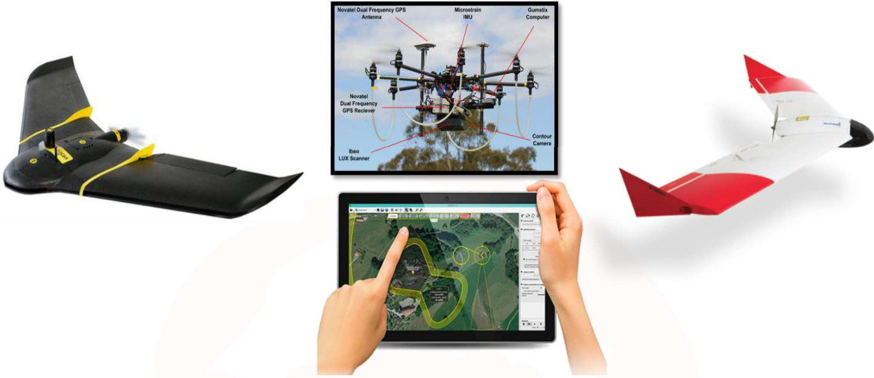
Figure 3. Data collection by UAV

remain in the air for up to 3.5 hours and during this time they can acquire aerial images that can produce ortho-images of approximately 15 square kilometers. All of these features make the UAV a fast, accurate data acquisition and easy to use, professional land surveying and ortho-image production tool.