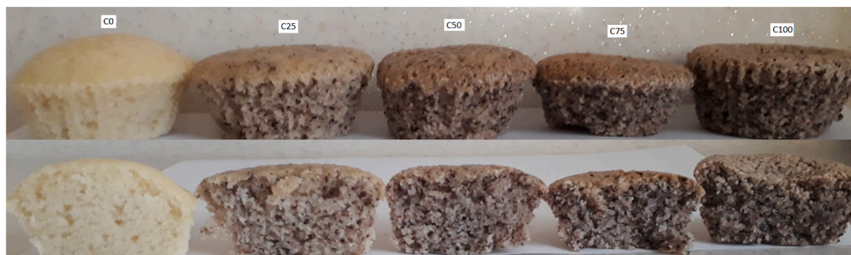
Fig. 1. Vegan cake samples.

Sensorial analyses were performed using SWARA-WASPAS method,