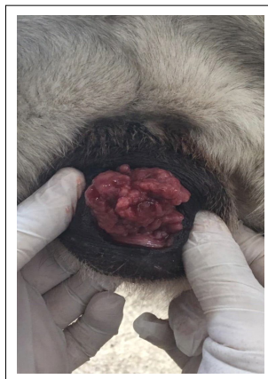
Fig 1: Transmissible venereal tumour in a bitch.

Iron (Fe) is an important element involved in many cellular processes, which is used by living cells. Studies have associated the element Fe with various diseases, including cancer (Abbaspour et al. , 2004). Excess Fe can lead to an increase in cell oxidative stress, resulting in accelerated damage to tissues and DNA (Ames, 2001). In studies